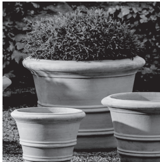
Campania International official dealer:

CAST STONE • TERRA COTTA • GLAZED POTTERY