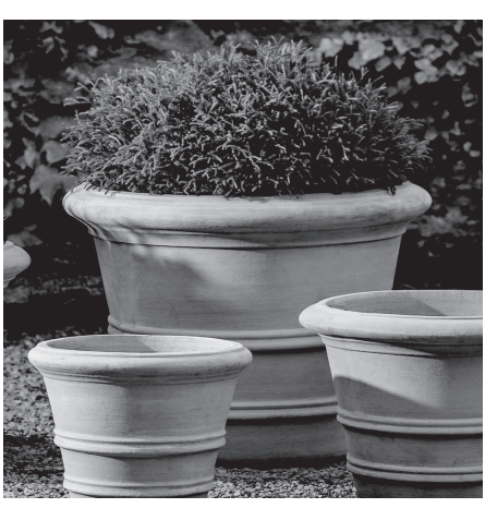
Campania International official dealer:

CAST STONE • TERRA COTTA • GLAZED POTTERY